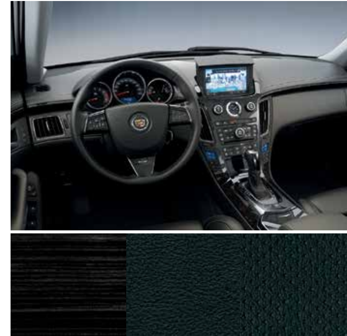
Ebony RECARO® performance seats with Ebony sueded microfiber inserts / Midnight Sapele Wood Trim 2